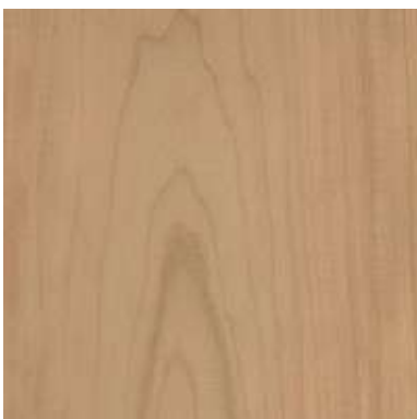
Black Cherry (plain)

Use: Small fittings and turned items, railings, blocks, mouldings, cap rails, trim work and wales, planking for decks and on the inside and outside of the bulwarks.