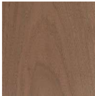
Black Walnut (plain)

Use: Frames, keels, decorative planking and moldings. Well suited for hull timbering and framing. Frequently seen as a second layer for hull planking in model ship kits, for which it is not well suited.