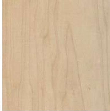
Hard Maple (plain)

Use: Suitable for hull and deck planking because of its honey color. Also suitable for small fittings, model bases and display cases.