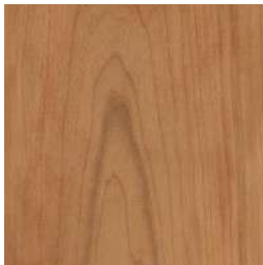
Black Cherry (treated)