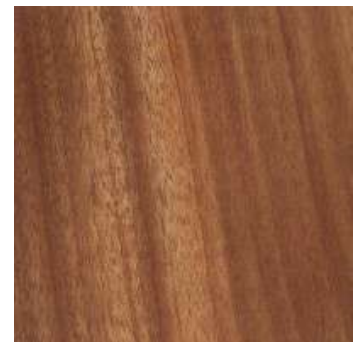
African Mahogany (treated)