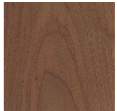
Black Walnut (treated)