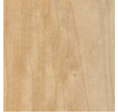
Hard Maple (treated)